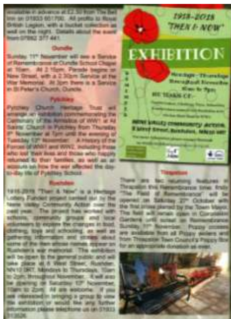
Raunds Round Up – Exhibition.